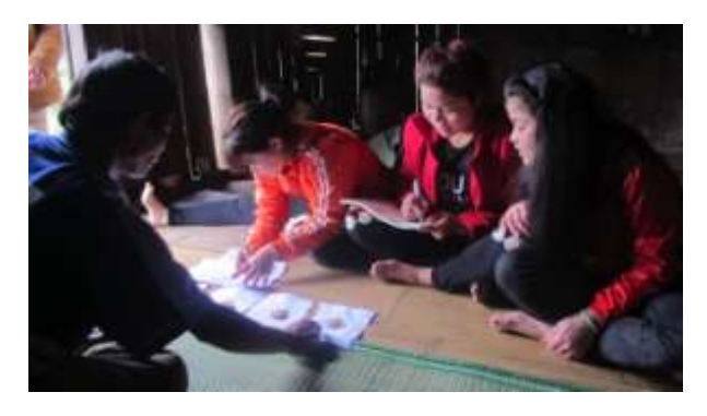
Studying and collecting local rice seeds