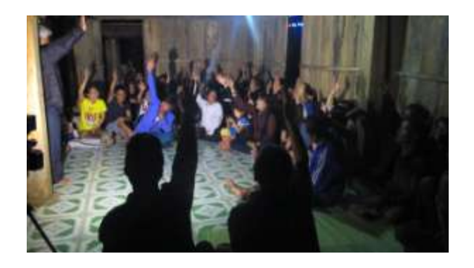
Villagers agree to get community land allocated instead of forestland title granted to household